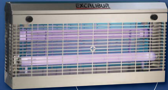
EXI 80 Stainless