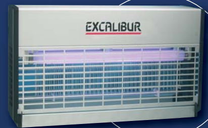
EXC 30 White