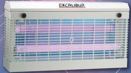
EXI 30 White